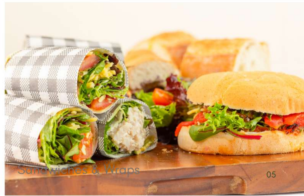
Sandwiches & Wraps