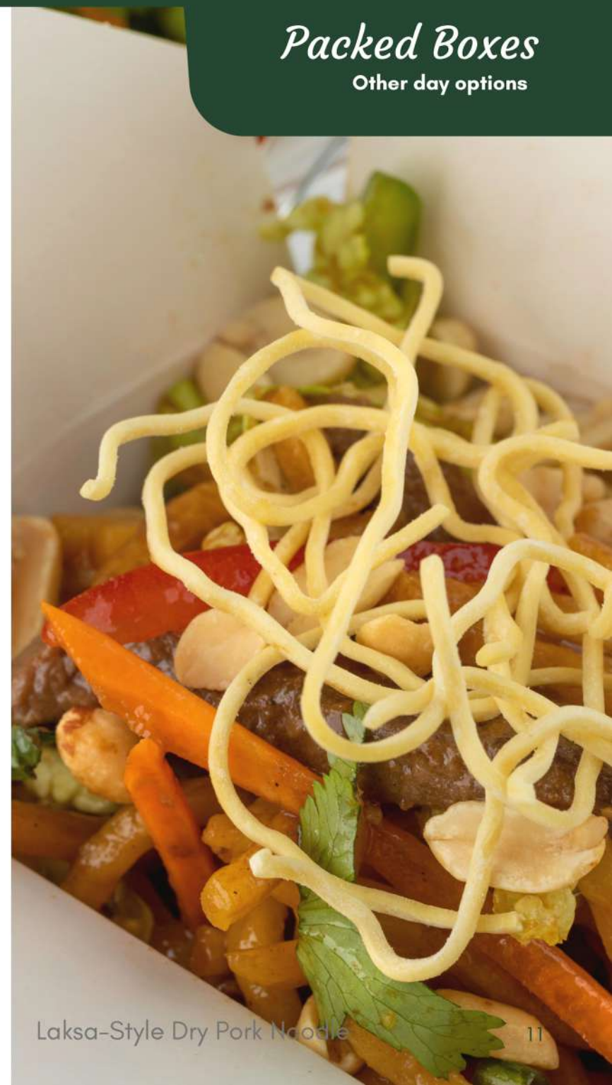
Laksa-Style Dry Pork Noodle